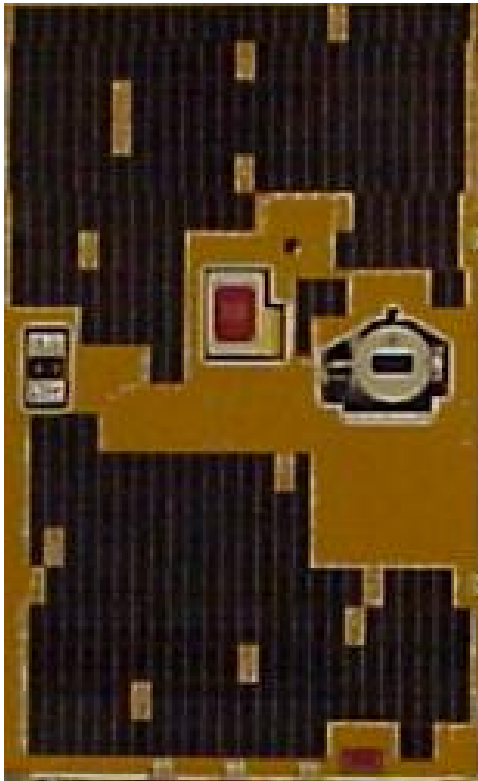
IMAGE satellite Face 1

The panel above is 136 centimeters long and 90 centimeters wide. The solar cells that generate the electricity are shown in black. The brown-colored areas do not generate electricity.