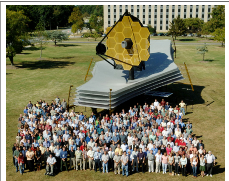
Life-size model of the Webb Space Telescope.

In 2018, the new Webb Space Telescope will be launched. This telescope, designed to detect distant sources of infrared 'heat' radiation, will be a powerful new instrument for discovering distant dwarf planets far beyond the orbit of Neptune and Pluto.