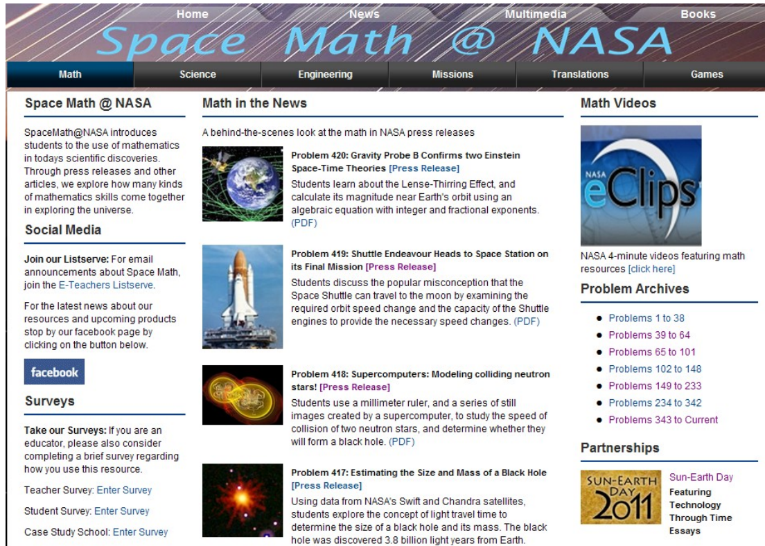
Figure 1 – A screen shot of part of the SpaceMath@NASA home page showing a few of its many offerings ( http://spacemath.gsfc.nasa.gov )